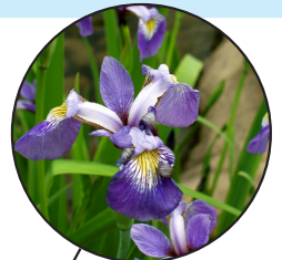
Larger Blue Flag Iris versicolor