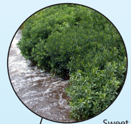
Sweet Gale Myrica gale

A visual guide can be useful as you work. Download this poster at www.crelaurentides.org