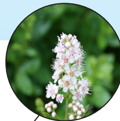
Large-leaved Meadowsweet Spiraea latifolia